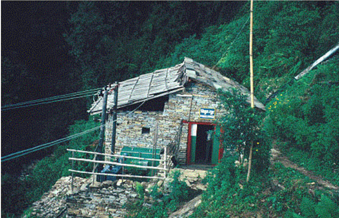
Figure 2: Micro hydro scheme showing the power house, the penstock and the transmission lines

to run all equipment at the rated design flow and load conditions, but it is not always practical or possible where river flow fluctuates throughout the year or where daily load patterns vary