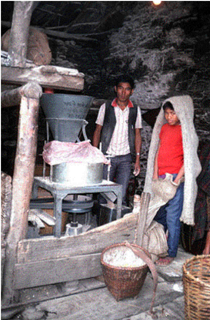
Figure 3: Micro hydro powered grain milling by villagers in Barpak, Nepal

Ownership, management Programmes promoting the use of micro-hydro power in developing countries have concentrated on the social, as well as the technical and economic aspects of this energy source. Technology transfer and capacity building programmes have enabled local design and manufacture to be adopted. Local management, ownership and community participation has meant that many schemes are under the control of local people who own, run and maintain them. Operation and maintenance is usually carried out by trained local craftspeople.